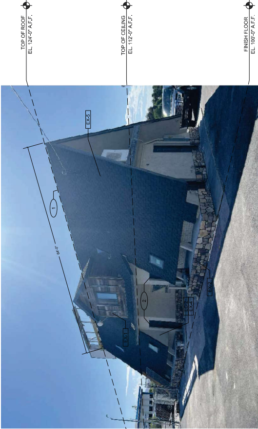
4 NORTHWEST ELEVATION