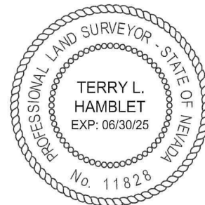
EXHIBIT 'B' TO ACCOMPANY LEGAL DESCRIPTION