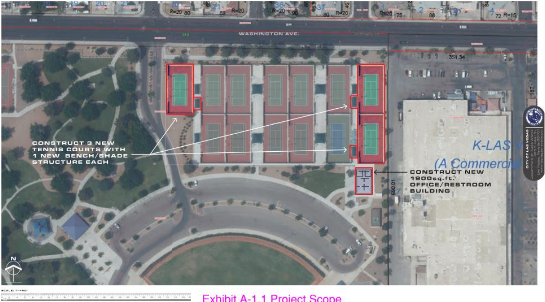
Exhibit A-1.1 Project Scope