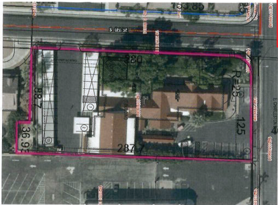
2 SITE ARIEL PLAN SCALE 1"=100'-0"