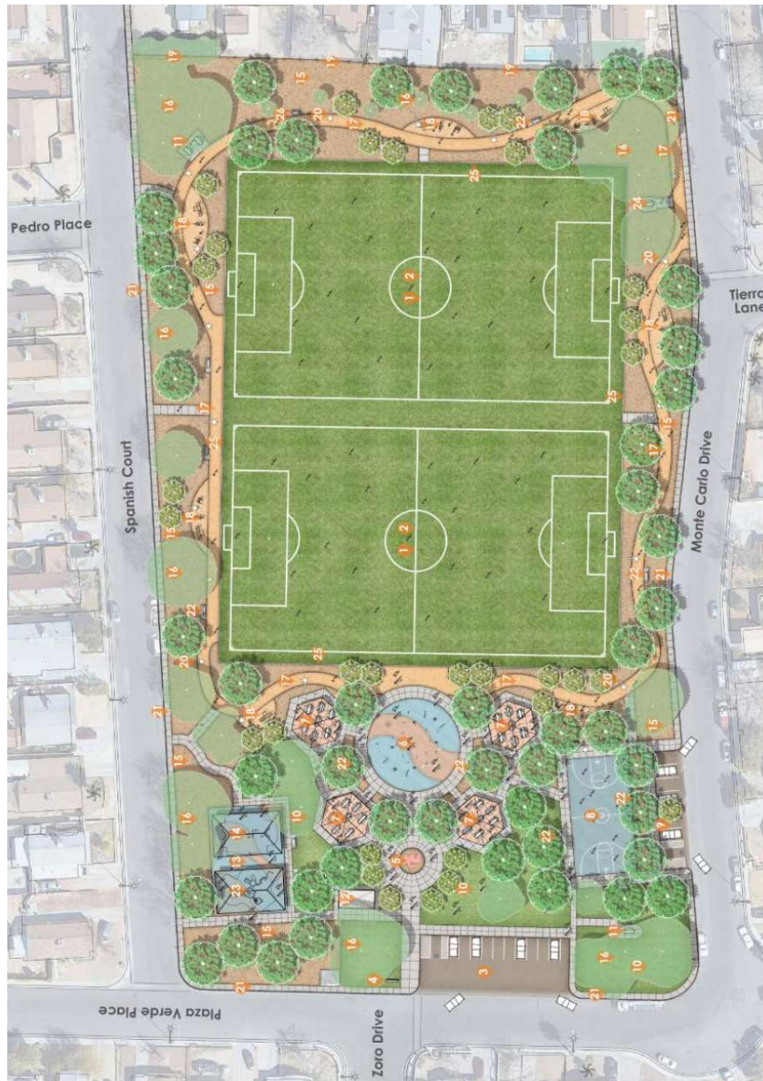
Heers Park Proposed Upgrades Exhibit A-1.2