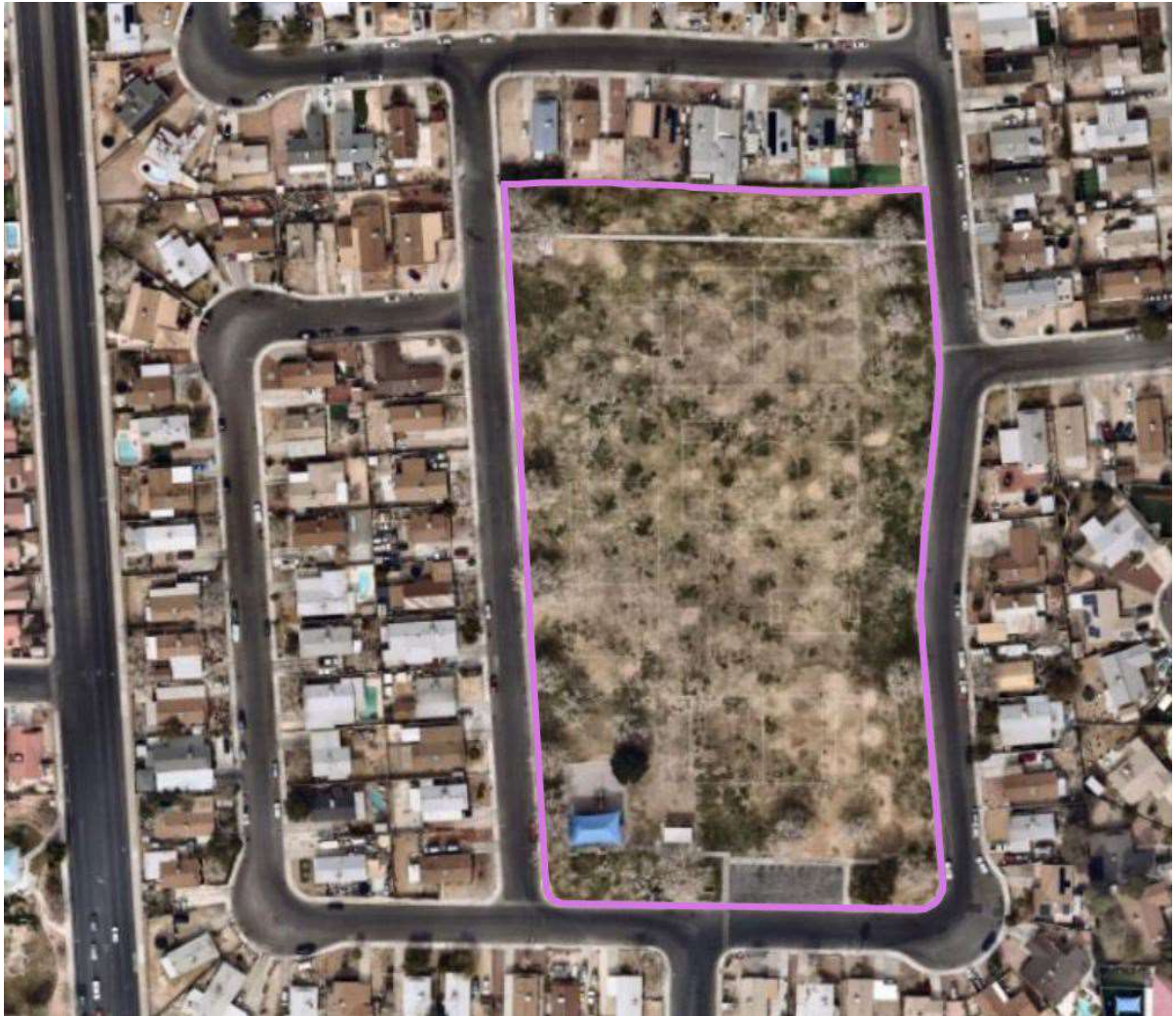
Existing Heers Park Exhibit A-1.1