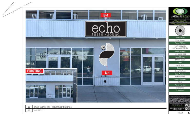
PROPOSED EXTERIOR SIGNAGE RENDERING