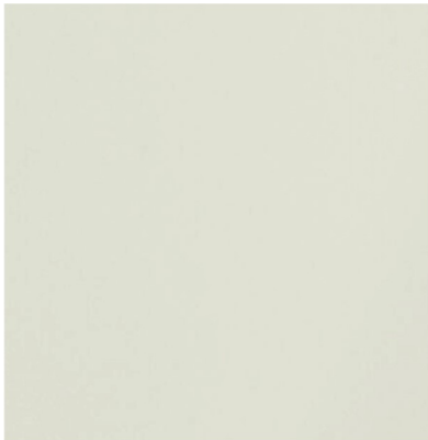
EC-2 STUCCO – SHERWIN WILLIAMS “NONCHALANT WHITE” SW6161