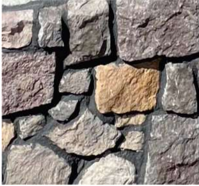
EX-2 EARTH TONED ROCK