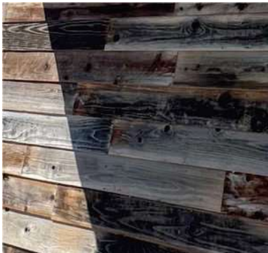
EX-1 RECLAIMED WOOD SIDING