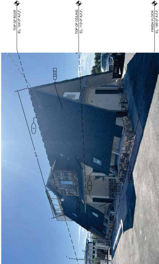
4 NORTHWEST ELEVATION