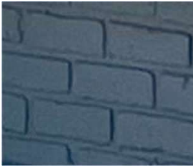
EX-3 BRICK VENEER