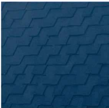
EX-5 ASPHALT SHINGLES