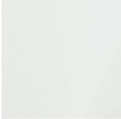
EC-1 BRICK VENEER – SHERWIN WILLIAMS “WINSOME GREY” SW9624