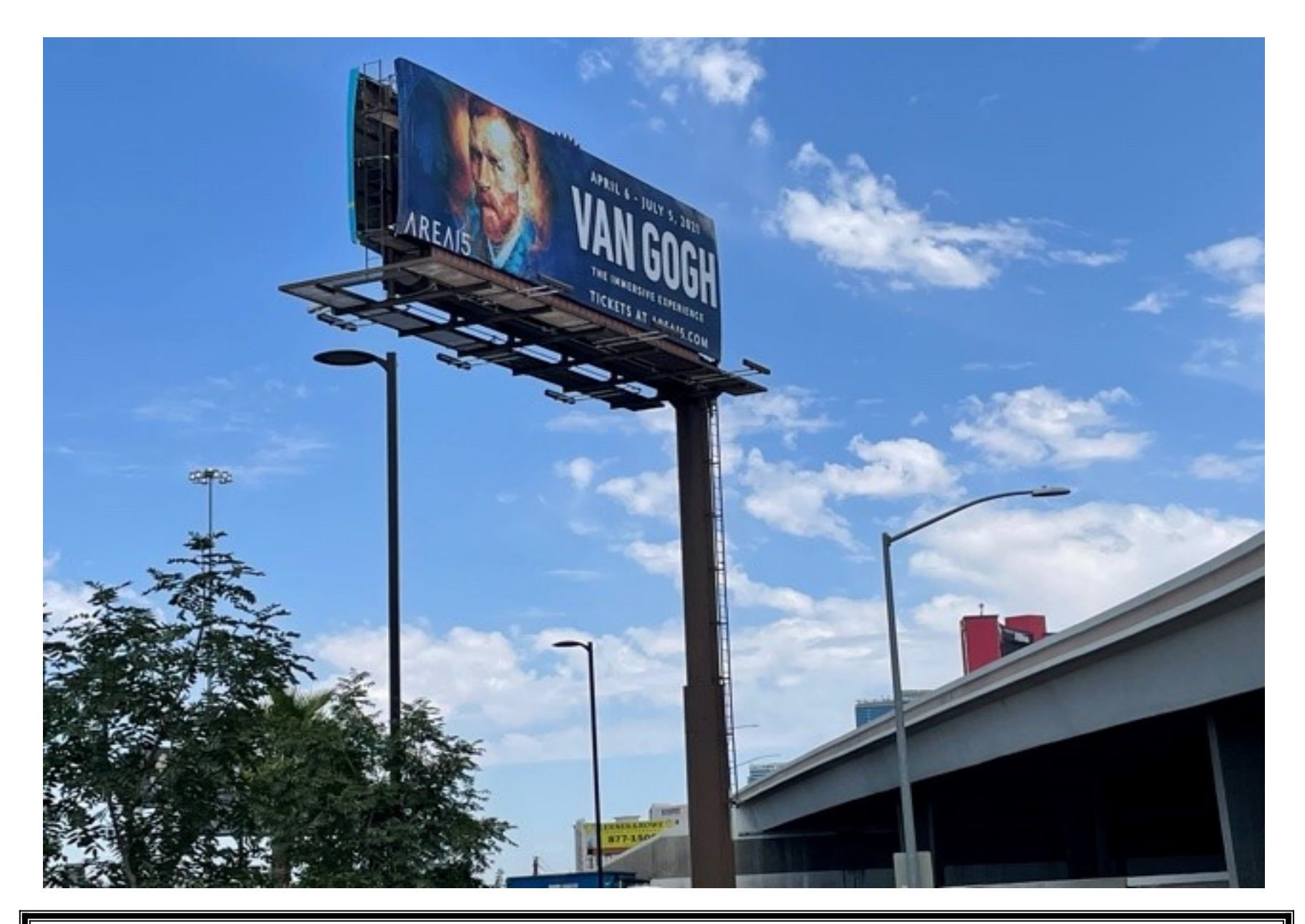
21-0293-RQR1 - APPLICANT: LAMAR CENTRAL OUTDOOR, LLC - OWNER: INTEGRAL PARTNERS PARK PLACE LV, LLC 3200 SOUTH RANCHO DRIVE