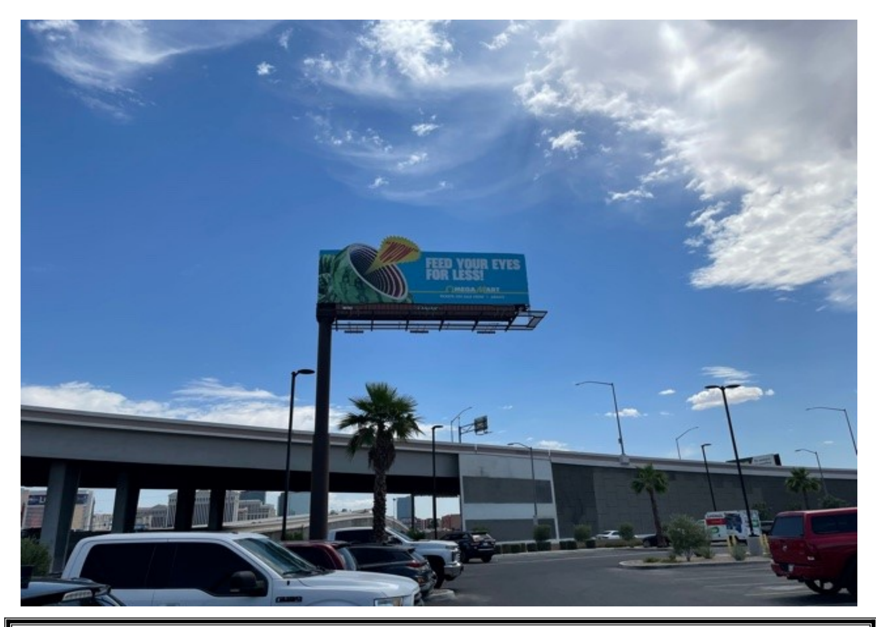
21-0293-RQR1 - APPLICANT: LAMAR CENTRAL OUTDOOR, LLC - OWNER: INTEGRAL PARTNERS PARK PLACE LV, LLC 3200 SOUTH RANCHO DRIVE