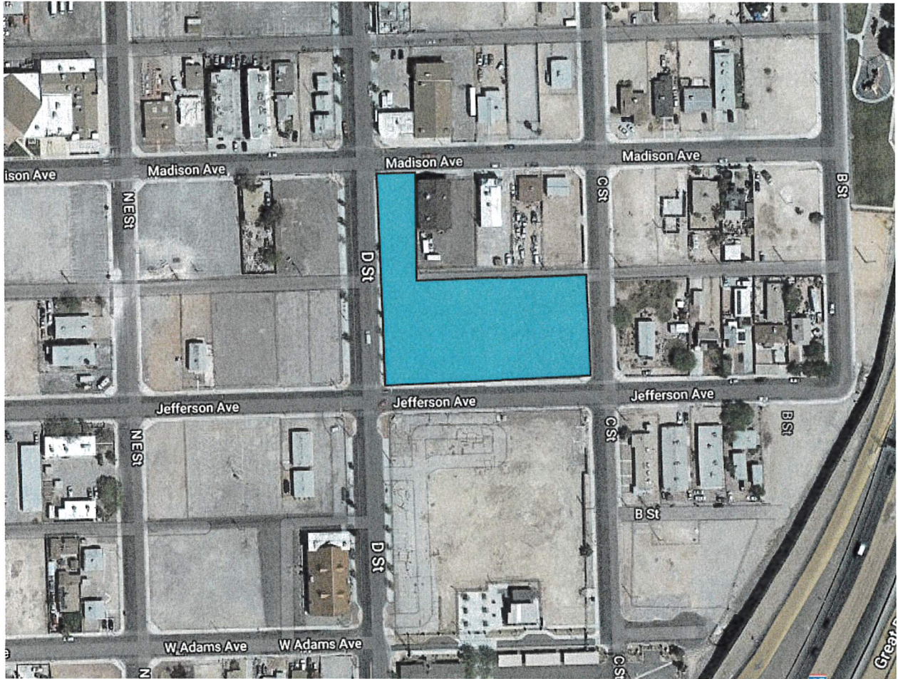
EXHIBIT C-2 DEPICTION OF SITE