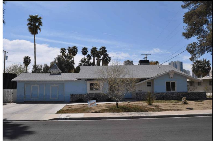
546 Barbara Way