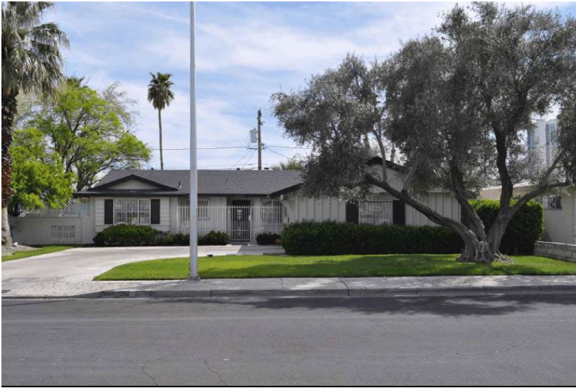
552 Bonita Avenue